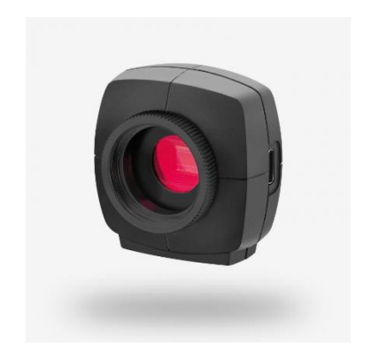
U3-3xx 0 XLE Rev.1

Illustrations may differ from the original.